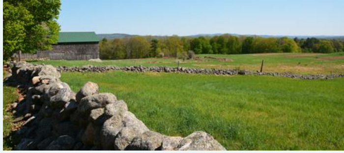
View of Joe Merrill's barn & fields, Loudon, N.H.

Questions? Email info@sanbornmills.org or call 603-435-7314 weekdays from 9 am to 3 pm.