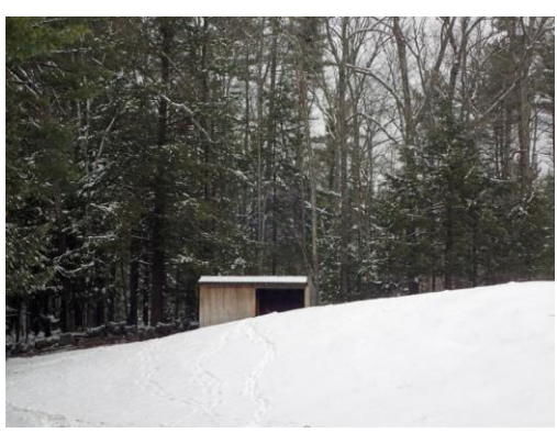
One of six run-in sheds on the farm.