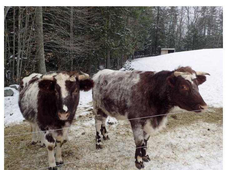
Ben & Bill looking for their next bale of hay.

A three-sided run-in shelter is the ideal solution for both winter and summer shelter and here are some important